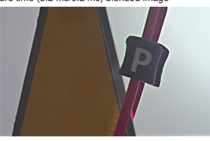
Multiple exposure HDR

<Photograph 3> Example of HDR image Condition: Exposure time (3.2 ms/0.2 ms) blended image